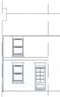
Existing front elevation

Notes The original DHS windows have been replaced with top hung PVC windows